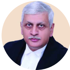
Hon'ble Mr. Justice Uday Umesh Lalit Executive Chairman, NALSA Judge, Supreme Court of India