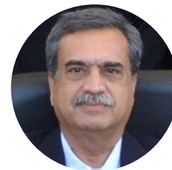
Hon'ble Mr. Justice M.R. Shah, Member, MCPC Judge, Supreme Court of India

Keeping in view the legislative mandate and the spirit of Section 89 of Code of Civil Procedure, the Mediation and Conciliation Project Committee [MCPC] was constituted by Supreme Court of India to oversee the effective implementation of Mediation and Conciliation in the country. Hon'ble Mr. Justice R.C. Lahoti, the then Chief Justice of India, by an Administrative Order, set up the Mediation and Conciliation Project Committee on 9th April, 2005, under the Chairmanship of Hon'ble Mr. Justice N. Santosh Hegde. MCPC ensures the regulated growth and evolution of mediation as dispute resolution mechanism in the country by laying down policies, monitoring their implementation and suggesting course correction measures.