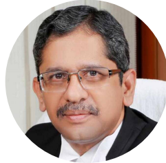
Hon'ble Mr. Justice N.V. Ramana, The Chief Justice of India, Patron-in-Chief, MCPC