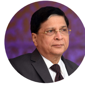
Hon'ble Mr. Justice Dipak Misra

Hon'ble Vice Chancellor, University of Delhi