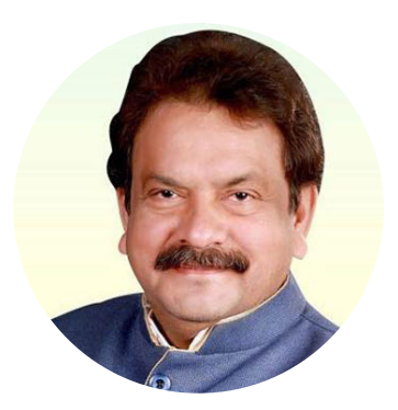
Hon'ble Prof. Satya Pal Singh Baghel Union Minister of State, Ministry of Law and Justice, GOI