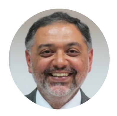
Hon'ble Mr. Justice G.S. Sandhawalia Judge, Punjab and Haryana High Court