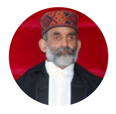
Hon'ble Mr. Justice Vivek Singh Thakur Judge, Himachal Pradesh High Court