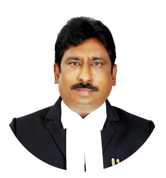
Hon'ble Mr. Justice Venkateswarlu Nimmagadda Judge, Andhra Pradesh High Court