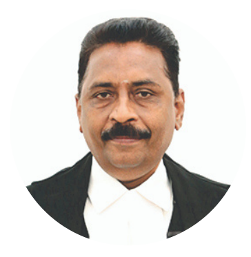
Hon'ble Mr. Justice M. Govindaraj Judge, Madras High Court